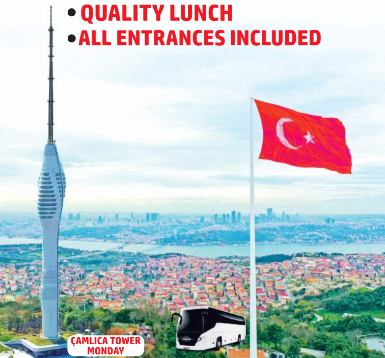
ÇAMLICA TOWER MONDAY